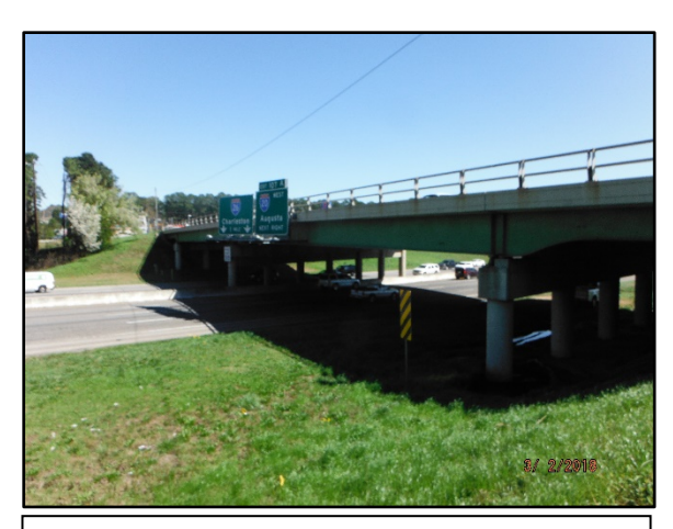
Photo 1 – View of the subject bridge, S-32-36 (St. Andrews Rd.) Bridge over I-26 looking up-station (Westward).

The existing bridge structure (~352.0'L x 78.5'W, inside curb to inside curb), is located on S-32-36 (St. Andrews Rd.) and crosses over I-26 in Lexington County, South Carolina. The bridge (SCDOT Bridge #327003600200) was constructed in 1981 according to the date stamped on the bridge's concrete guardrail. The bridge is a five-lane, four (4) span bridge constructed with poured-in-place concrete bridge deck spans, concrete curb and gutters with steel galvanized guardrails and concrete sidewalks on both sides of the bridge. Each span is supported by twelve (12) structural steel beams with steel diaphragms. The bridge beams are supported by two (2) end bents and three (3) interior bents. According to the SCDOT bridge drawings provided, and through onsite observations made in the field, the beam